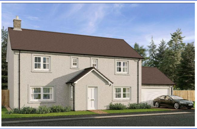
This image is not plot specific (Sun Room is not shown)